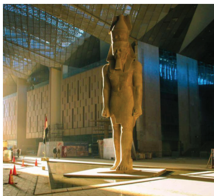
GRAND EGYPTIAN MUSEUM