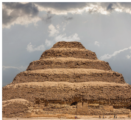
SAQQARA & DAHSHUR