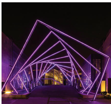
WALK OF CAIRO