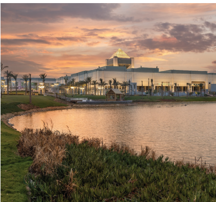
THE NATIONAL MUSEUM OF EGYPTIAN CIVILIZATION