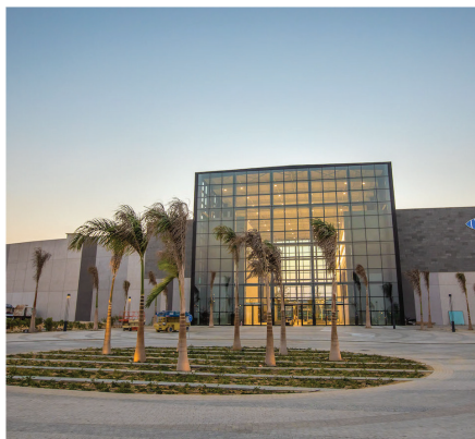
MALL OF ARABIA