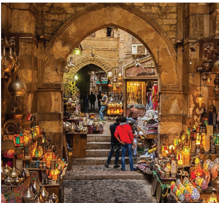
KHAN EL KHALILY