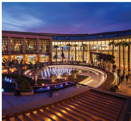
MALL OF EGYPT